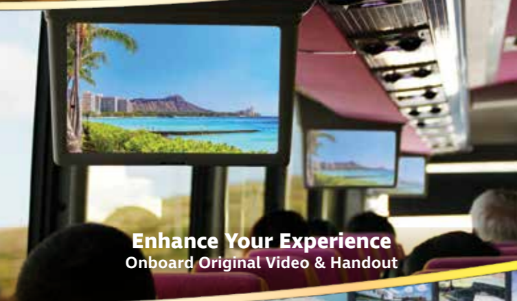
Enhance Your Experience Onboard Original Video & Handout