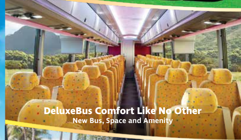
DeluxeBus Comfort Like No Other New Bus, Space and Amenity