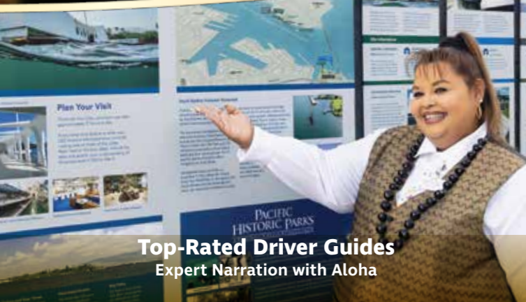
Top-Rated Driver Guides Expert Narration with Aloha