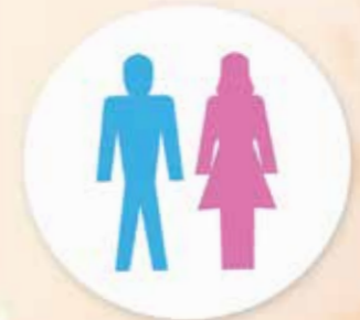
For Your Convenience Onboard Restroom