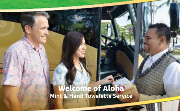
Welcome of Aloha Mint & Hand Towelette Service