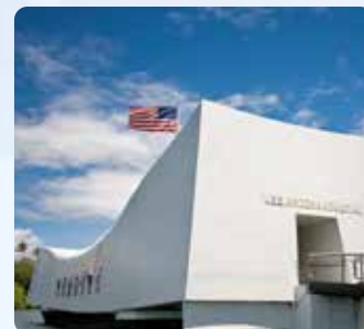
Arizona Memorial Reserved ticket for boarding (75 minutes)