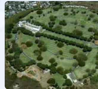
Punchbowl Crater With a panoramic view of Honolulu (window view)