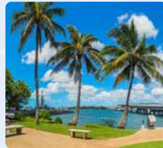
Pearl Harbor Visitor Center and more