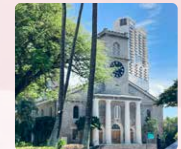
Historical Downtown Kawaiahao Church, Iolani Palace and more (window view)