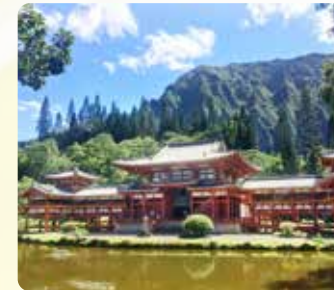
Byodo-In Temple Reserved Ticket Lush and serene Japanese temple and garden (20 minutes)