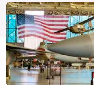
Be on the Actual Site of WWII Historic hangars at the Pearl Harbor Aviation Museum