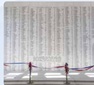
Arizona Memorial Reserved ticket for boarding (75 minutes)