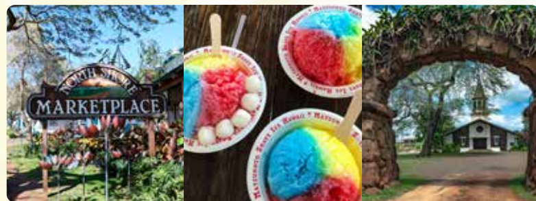
Explore North Shore Surfing Town Try famous garlic shrimp plates, burgers and shave ice (lunch on your own)

Haleiwa Town (40 minutes) & Waialua (20 minutes)