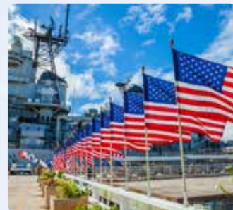
USS Missouri On Ford Island with reserved ticket included (1½ hours)