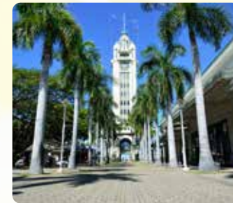
Aloha Tower Landmark and historical downtown (window view)