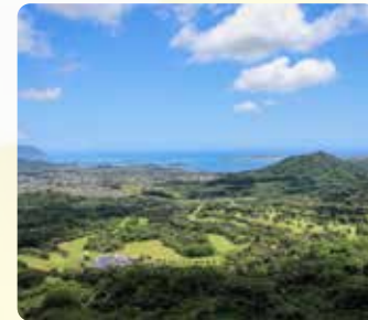
Nu'uuanu Pali Lookout Scenic view and historic battle site (10 minutes)