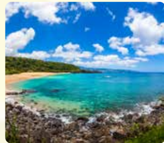
North Shore Beaches World famous surfing spot (window view)