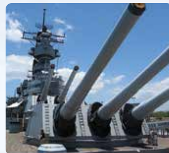
USS Missouri On Ford Island with reserved ticket included (1½ hours)