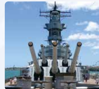
USS Missouri Historic battleship where World War II ended (1½ hours)