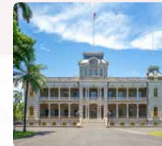
Historical Downtown Iolani Palace, Kawaiahao Church and more (window view)