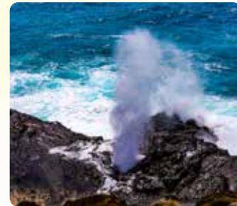
Halona Blowhole Nature's wonder (5 minutes)