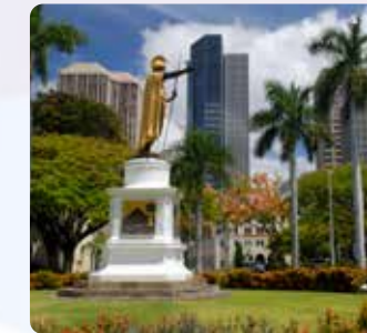
Historical Downtown King Kamehameha Statue and more (window view)