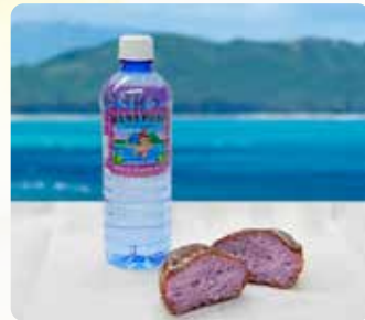
Breakfast Poi malasada and cold bottle of Hawaiian water