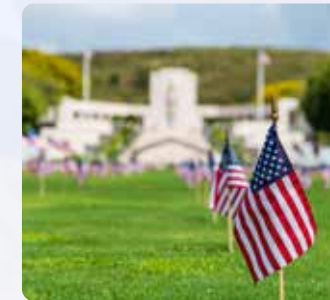
National Memorial Cemetery of the Pacific where the brave are laid to rest (window view)