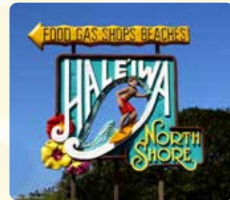
Haleiwa North Shore surfing town