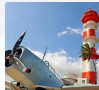
Pearl Harbor Aviation Museum On Ford Island with reserved ticket included (1½ hrs)