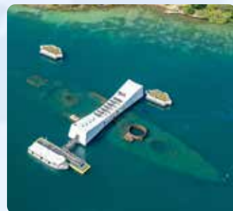
Ultimate Pearl Harbor Complete World War II Experience

With Reserved Tickets for Arizona Memorial, USS Missouri & Pearl Harbor Aviation Museum