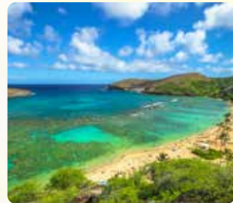
Hanauma Bay Nature Preserve Marine sanctuary (window view)