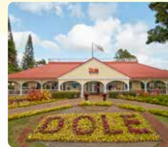
Dole Pineapple Plantation Try delicious Dole Whip (30 minutes)