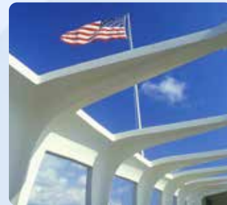
Arizona Memorial Reserved ticket for boarding (75 minutes)