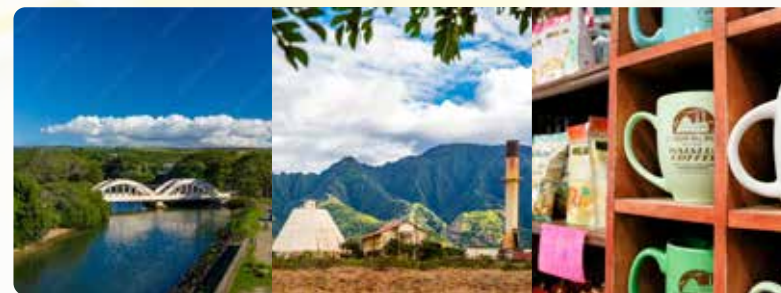
Waialua Coffee & Soap Factory Experience Haleiwa town and then get a glimpse of Old Sugar Mill

Haleiwa Town (40 minutes) & Waialua (20 minutes)