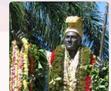
King Kamehameha Statue Historic Landmark (window view)