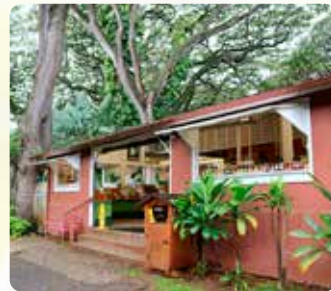
Tropical Farms Sampling of Hawaiian coffee and nuts (20 minutes)