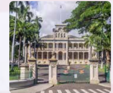
Iolani Palace Only Royal Palace in the United States (window view)