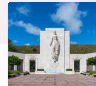
National Memorial Cemetery of the Pacific where the brave are laid to rest (window view)