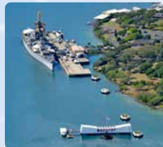
Deluxe Pearl Harbor Be where World War II began and ended

With Reserved Tickets for Arizona Memorial & USS Missouri