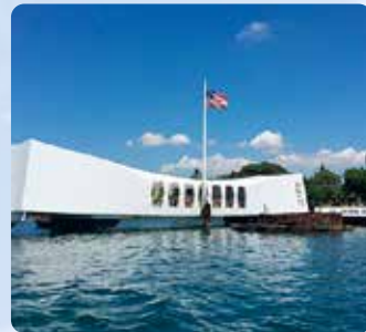
Pearl Harbor Experience Be onboard the Arizona Memorial

With Reserved Ticket for Arizona Memorial