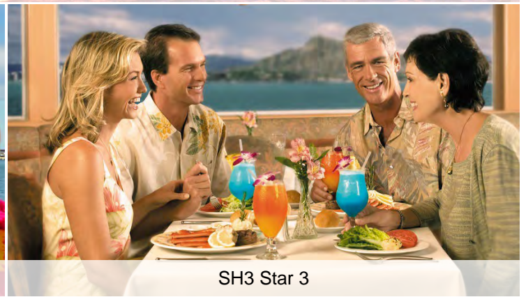
SH3 Star 3