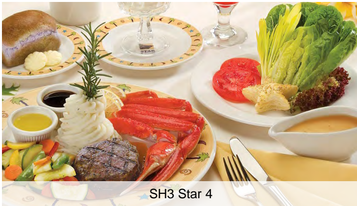
SH3 Star 4