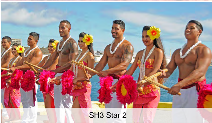
SH3 Star 2