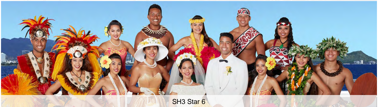
SH3 Star 6

All images & video are copyrighted; any use must expressly provide photo credit to Star of Honolulu Cruises & Events®.