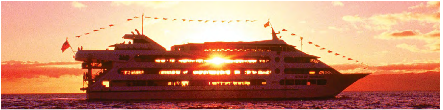
SH3 Star 1

Preview our library and download full-size, high-resolution images at StarofHonolulu.com/Travel-Partners-Images .