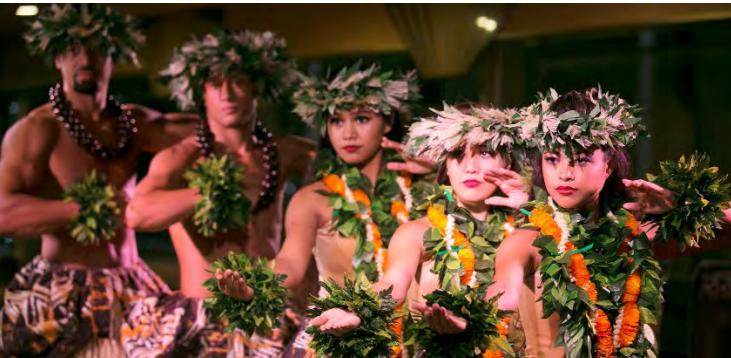
PGE6 The Hula To-Go 3