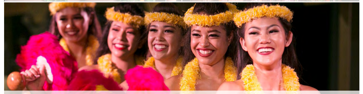
PGE6 The Hula To-Go 4