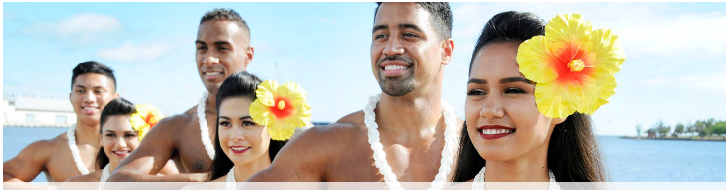
PGE6 The Hula To-Go 1

Preview our library and download full-size, high-resolution images at StarofHonolulu.com/Travel-Partners-Images.