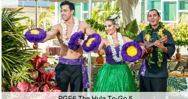
PGE6 The Hula To-Go 5