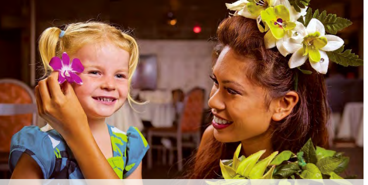
PGE6 The Hula To-Go 6