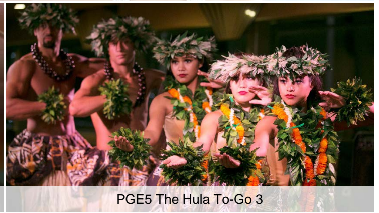
PGE5 The Hula To-Go 3