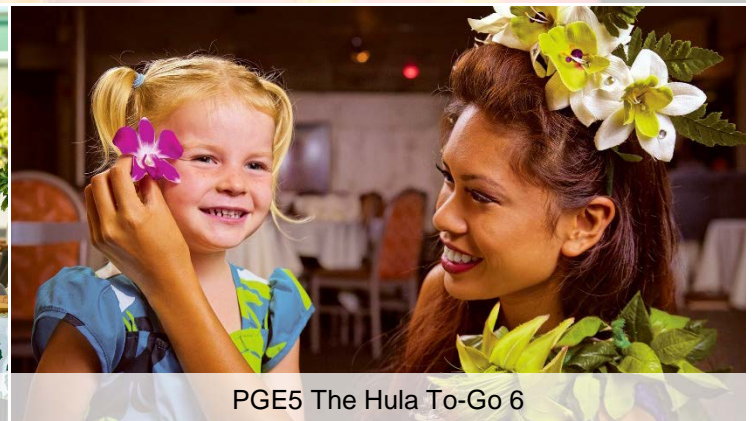
PGE5 The Hula To-Go 6

All images & video are copyrighted; any use must expressly provide photo credit to Paradise To-Go®.