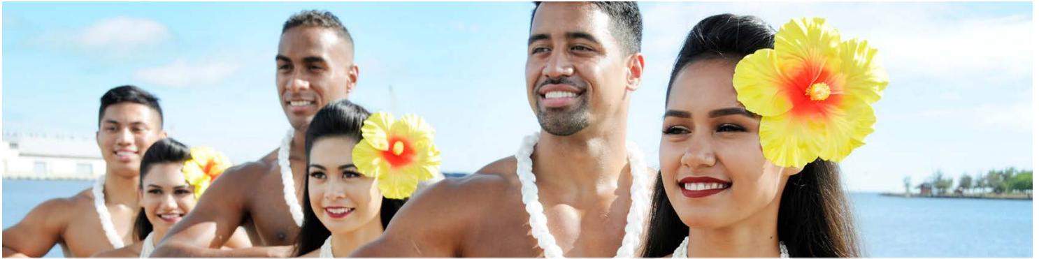
PGE5 The Hula To-Go 1

Preview our library and download full-size, high-resolution images at StarofHonolulu.com/Travel-Partners-Images .