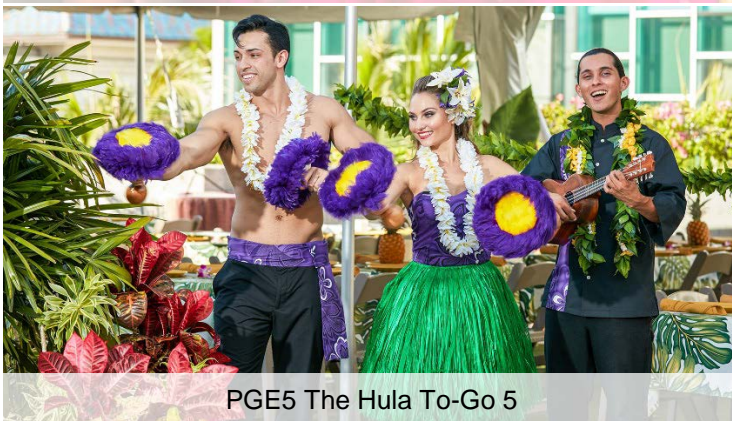
PGE5 The Hula To-Go 5