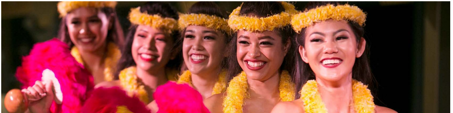
PGE5 The Hula To-Go 4