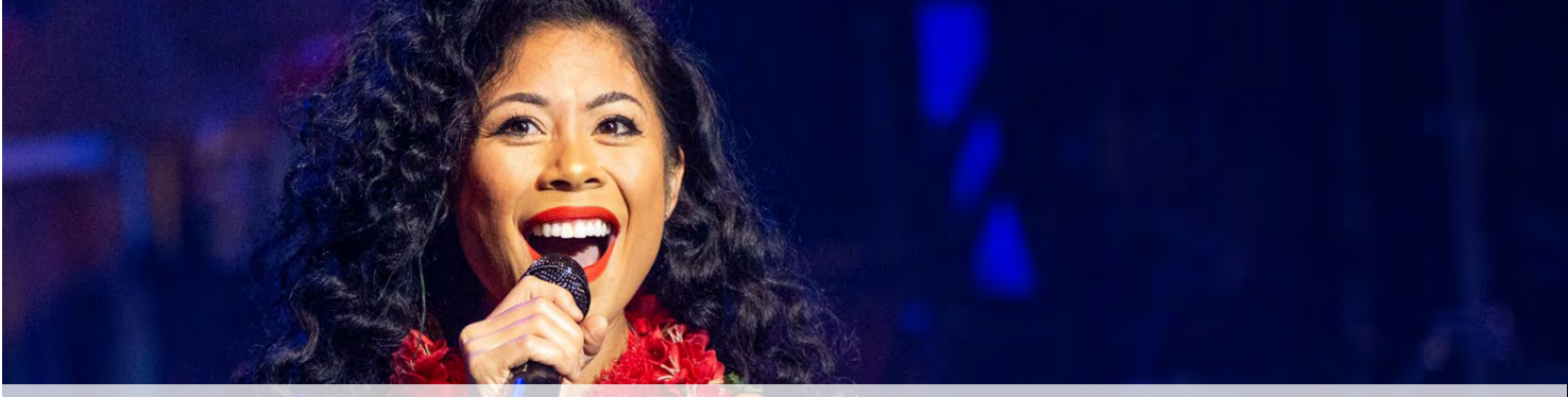
RHE3 Original Waikiki Luau 4