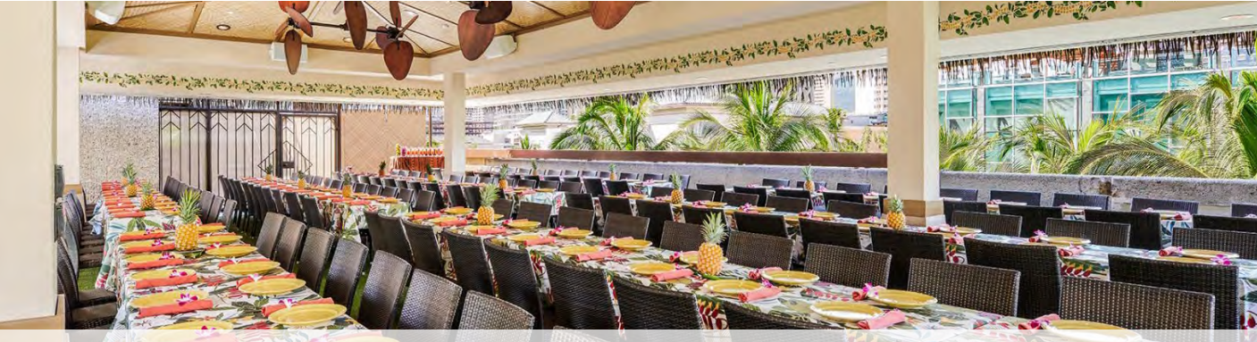
RHE3 Original Waikiki Luau 1