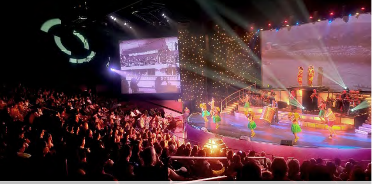
RHE3 Original Waikiki Luau 6

All images & video are copyrighted; any use must expressly provide photo credit to Rock-A-Hula®.