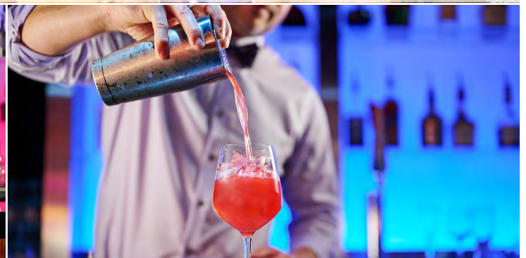
RHE8 Cocktail Music Lounge 6