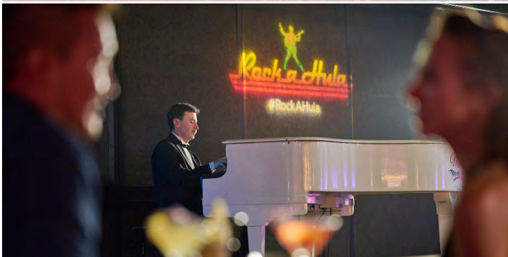
RHE8 Cocktail Music Lounge 2