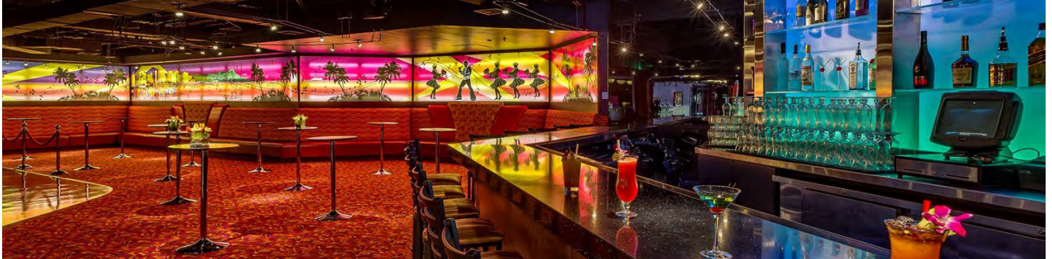
RHE8 Cocktail Music Lounge 1

Preview our library and download full-size, high-resolution images at StarofHonolulu.com/Travel-Partners-Images .