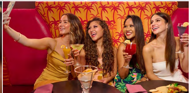
RHE8 Cocktail Music Lounge 3