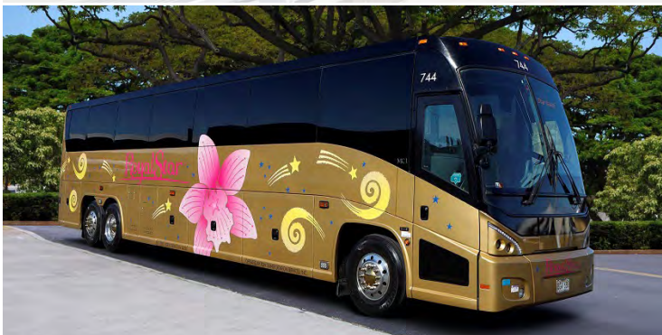
RS2 Deluxe Pearl Harbor Experience 2