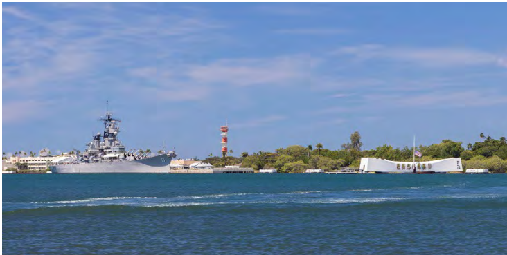
RS2 Deluxe Pearl Harbor Experience 4