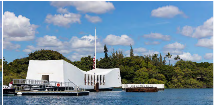
RS2 Deluxe Pearl Harbor Experience 5