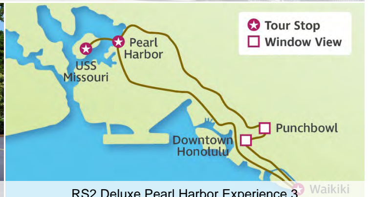
RS2 Deluxe Pearl Harbor Experience 3