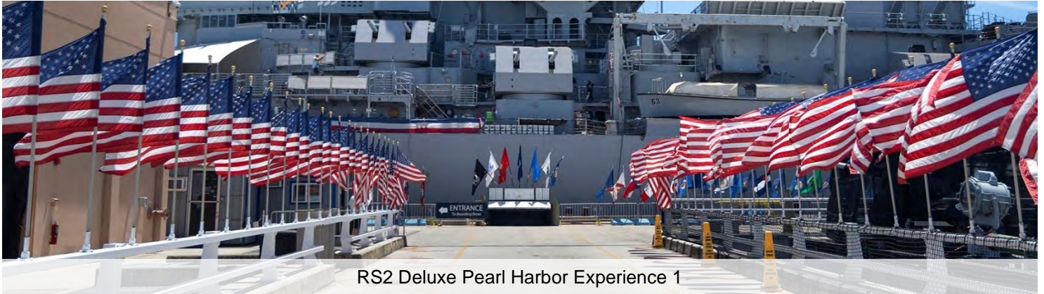
RS2 Deluxe Pearl Harbor Experience 1

Preview our library and download full-size, high-resolution images at StarofHonolulu.com/Travel-Partners-Images .