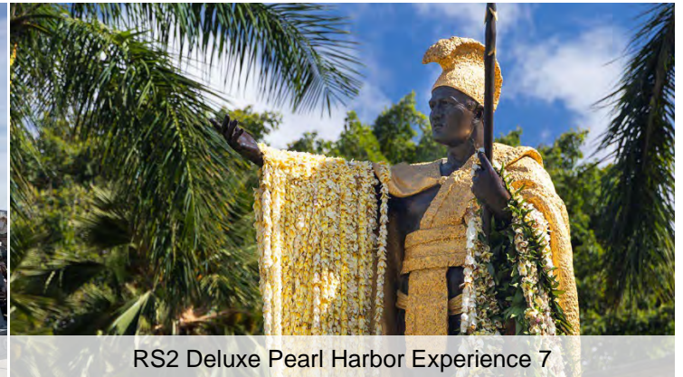
RS2 Deluxe Pearl Harbor Experience 7

All images & video are copyrighted; any use must expressly provide photo credit to Royal Star Hawaii®.