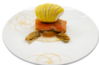
Baked Salmon with Lemon Dill Butter Sauce