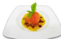
Concasse Vine-Ripened Tomato Confit & Golden Beets with Balsamic Reduction