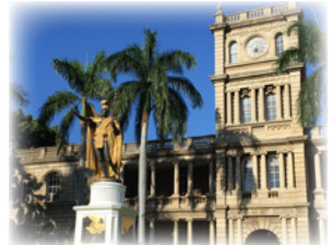
Downtown Honolulu (window view)