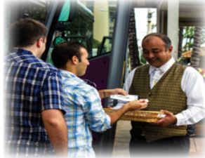
Mint and Hand Towelette Service