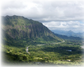
Nuuanu Pali (10 minutes)