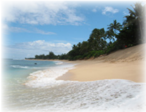
North Shore Beach (window view)