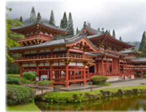
Byodo-In Temple (20 minutes)