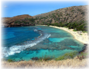
Hanauma Bay (10 minutes)