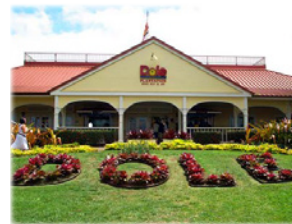
Dole Plantation (30 minutes)