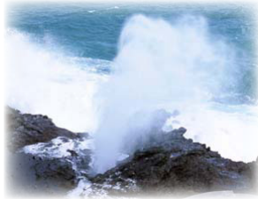
Halona Blow Hole (5 minutes)