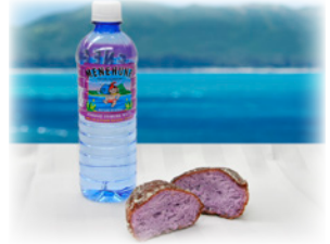
Breakfast from Kamehameha Bakery