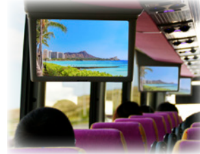
Onboard Video and In-Depth Driver Narration