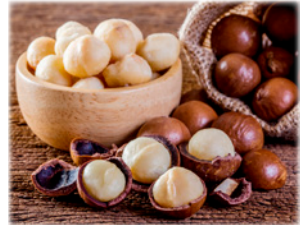
Tropical Farms (20 minutes)