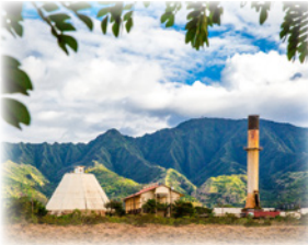
(B) Haleiwa (40 minutes), plus Waialua Coffee / Soap Factory (20 minutes)