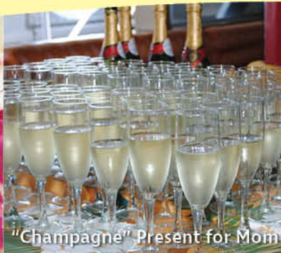
"Champagne" Present for Mom