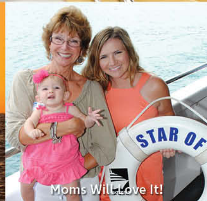
Moms Will Love It!