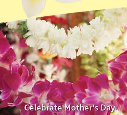
Celebrate Mother's Day

Celebrate Mother's Day on the STAR! $115.00 Adult, $69.00 Child