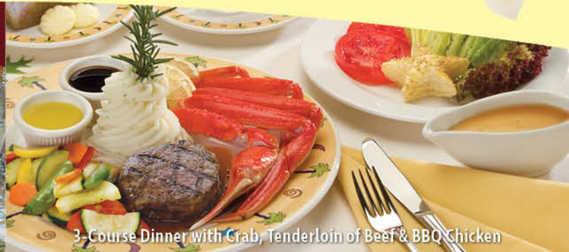
3-Course Dinner with Crab, Tenderloin of Beef & BBQ Chicken