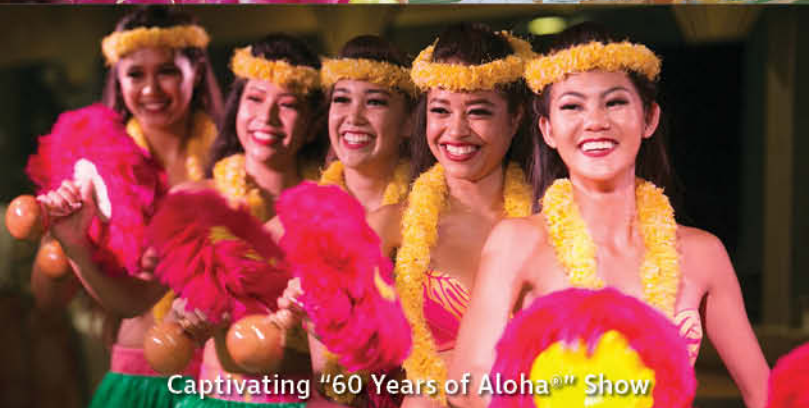
Captivating "60 Years of Aloha" Show