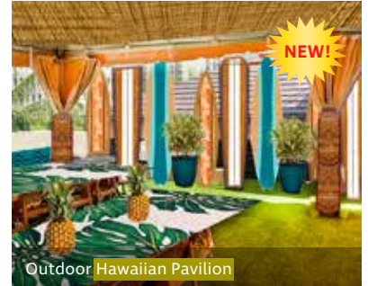
Outdoor Hawaiian Pavilion