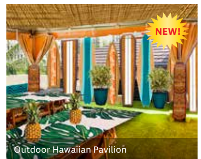
Outdoor Hawaiian Pavilion