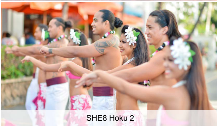
SHE8 Hoku 2