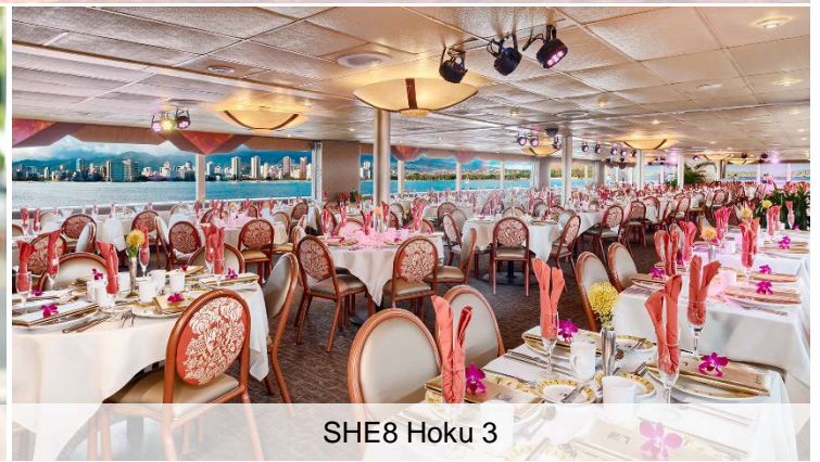
SHE8 Hoku 3