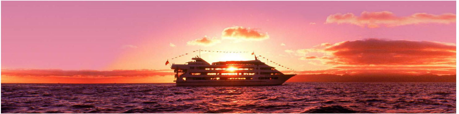
SHE8 Hoku 1

Preview our library and download full-size, high-resolution images at StarofHonolulu.com/Travel-Partners-Images .