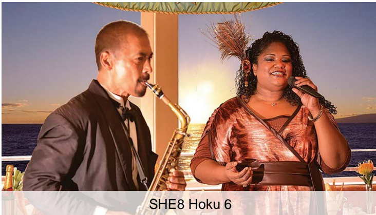
SHE8 Hoku 6