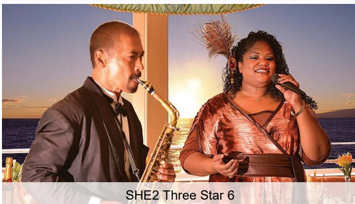
SHE2 Three Star 6