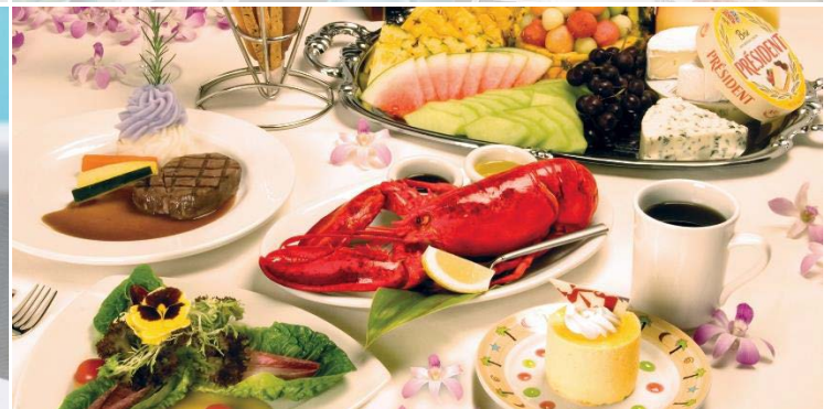
SHE2 Three Star 5