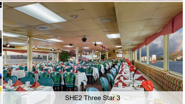
SHE2 Three Star 3