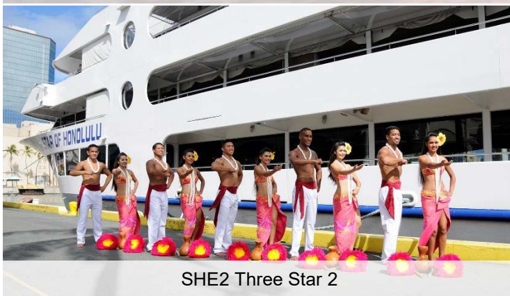
SHE2 Three Star 2