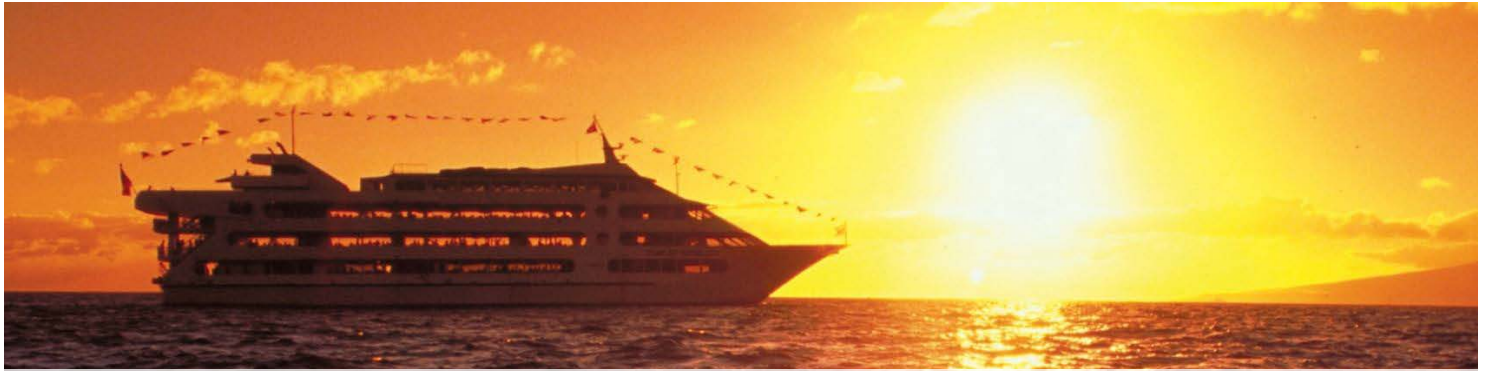
SHE2 Three Star 1

Preview our library and download full-size, high-resolution images at StarofHonolulu.com/Travel-Partners-Images .