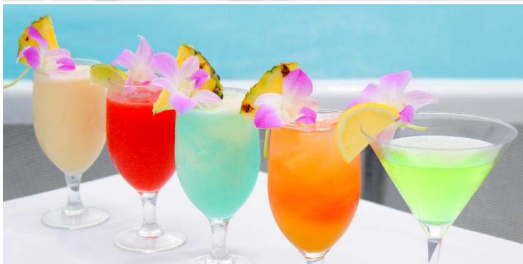
SHE2 Three Star 4