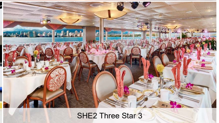
SHE2 Three Star 3