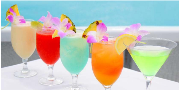
SHE2 Three Star 4