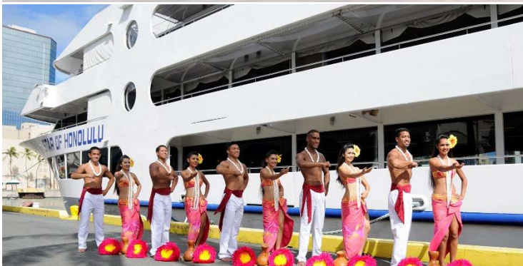
SHE2 Three Star 2