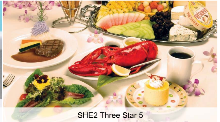
SHE2 Three Star 5