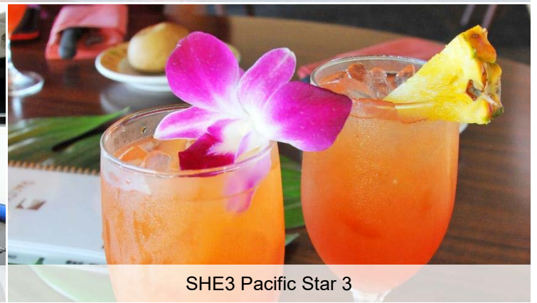
SHE3 Pacific Star 3