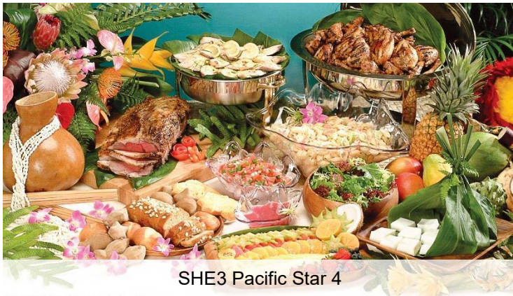
SHE3 Pacific Star 4