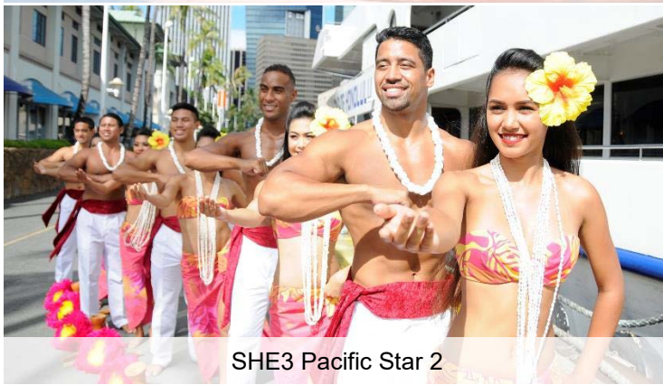
SHE3 Pacific Star 2