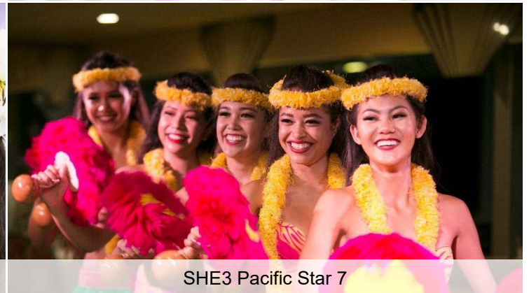
SHE3 Pacific Star 7

All images & video are copyrighted; any use must expressly provide photo credit to Star of Honolulu Cruises & Events®.