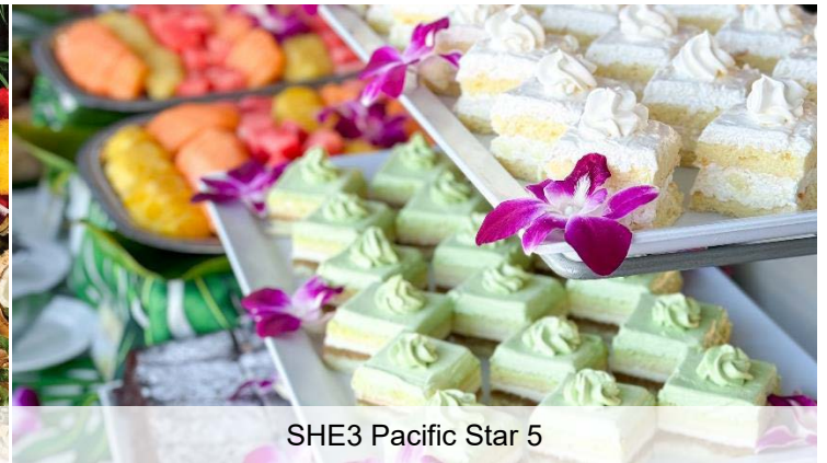
SHE3 Pacific Star 5