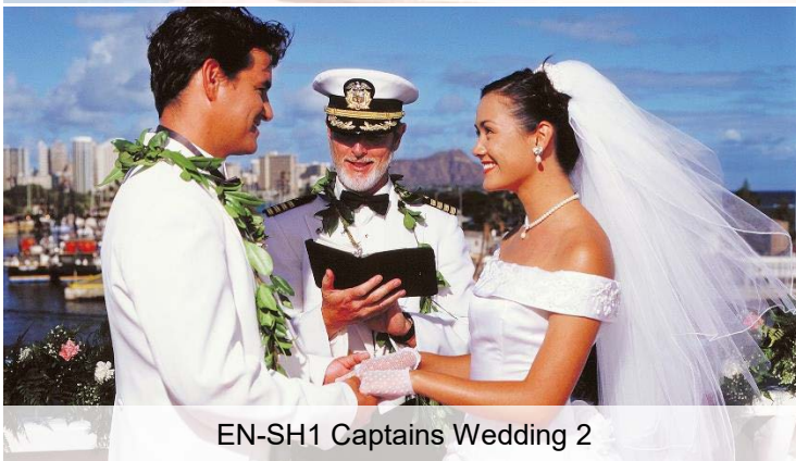
EN-SH1 Captains Wedding 2