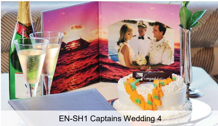
EN-SH1 Captains Wedding 4