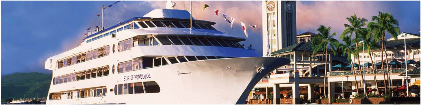
EN-SH1 Captains Wedding 1

Preview our library and download full-size, high-resolution images at StarofHonolulu.com/Travel-Partners-Images .