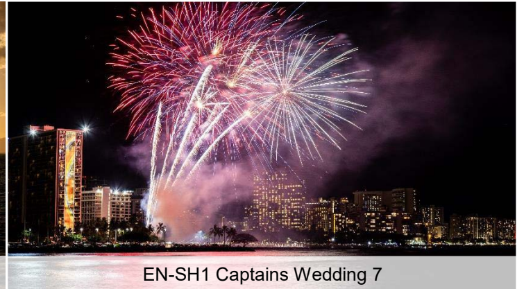
EN-SH1 Captains Wedding 7