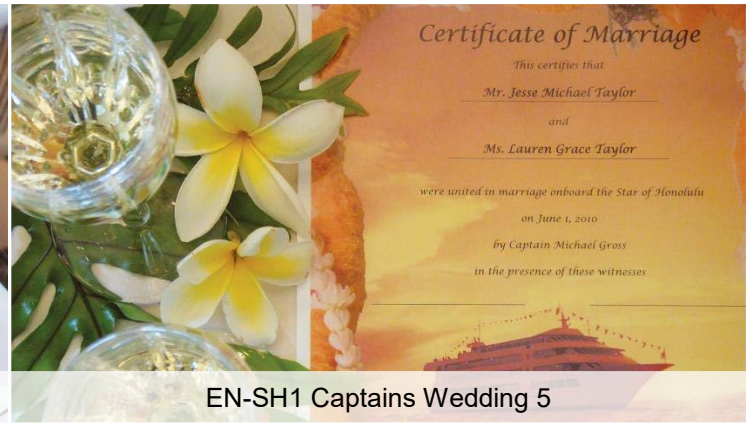
EN-SH1 Captains Wedding 5