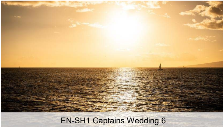
EN-SH1 Captains Wedding 6