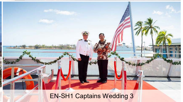
EN-SH1 Captains Wedding 3