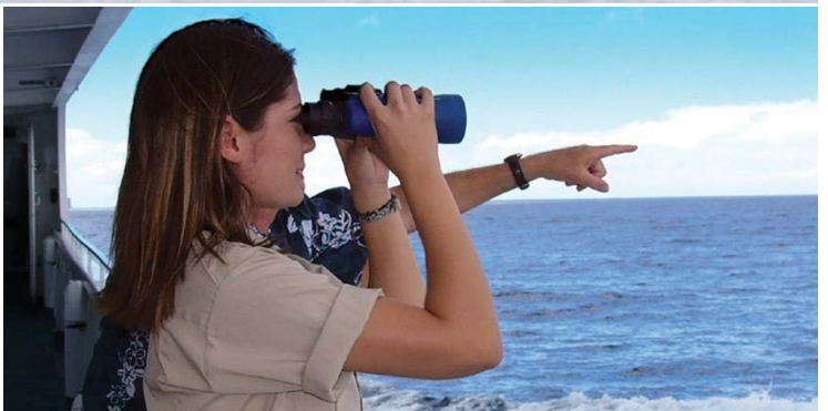
SHE4 Early Bird Whale Watch 3