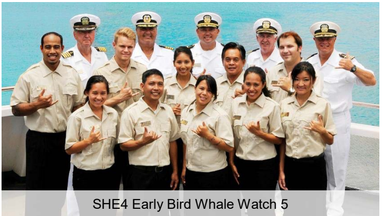
SHE4 Early Bird Whale Watch 5