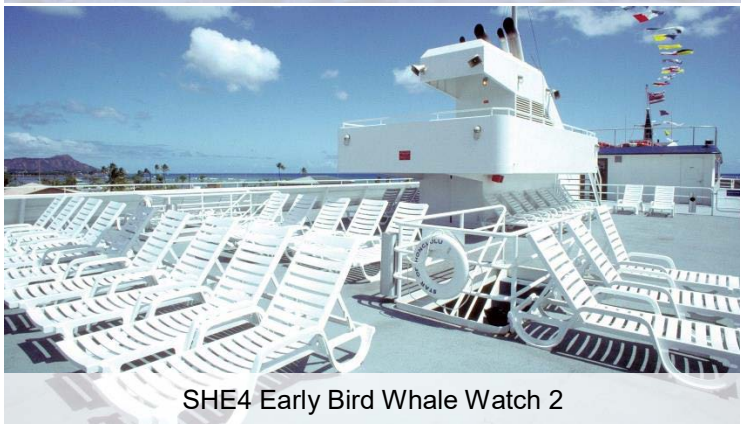
SHE4 Early Bird Whale Watch 2