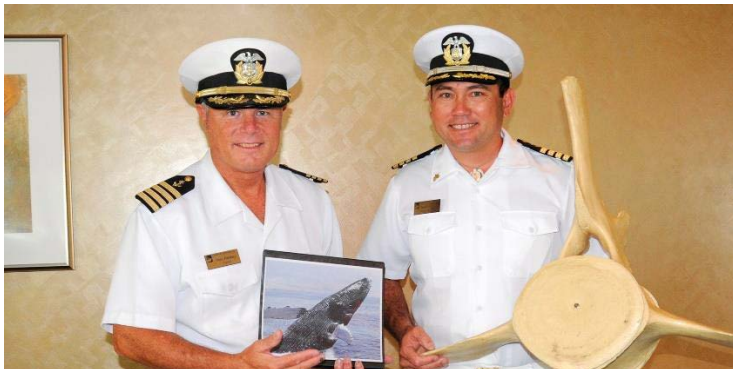
SHE4 Early Bird Whale Watch 4