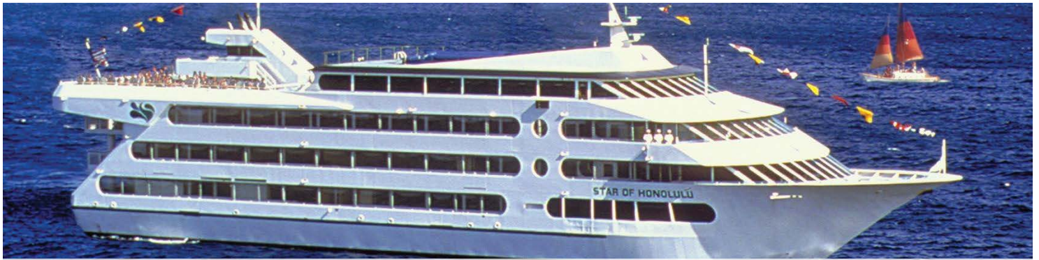
SHE4 Early Bird Whale Watch 1

Preview our library and download full-size, high-resolution images at StarofHonolulu.com/Travel-Partners-Images .