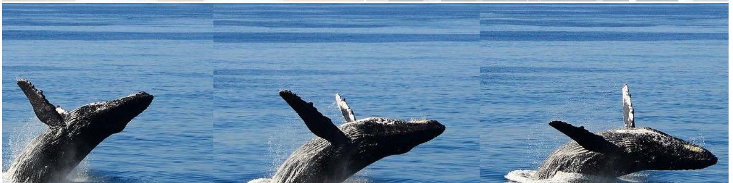
SHE4 Early Bird Whale Watch 6 – 9