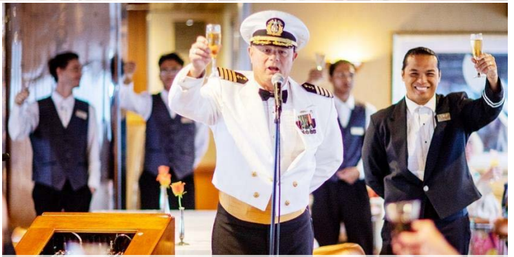
SHE5 Private Reception Nova Five Star 4