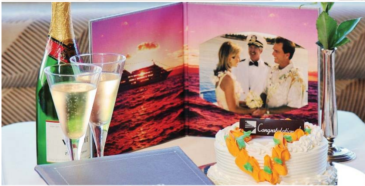
SHE5 Private Reception Nova Five Star 3