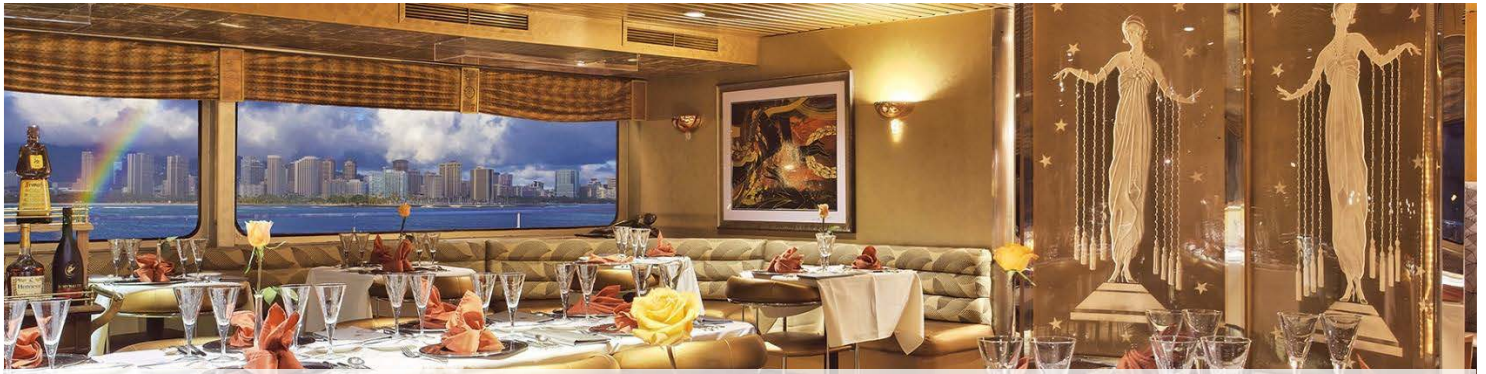
SHE5 Private Reception Nova Five Star 2