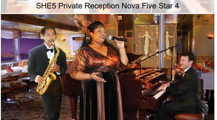
SHE5 Private Reception Nova Five Star 6