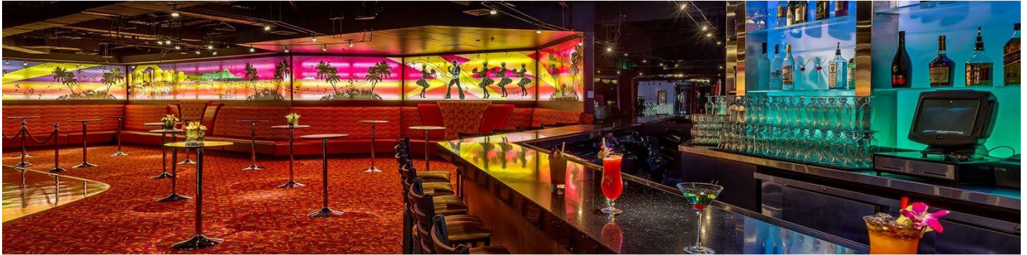
RHE7 Cocktail Music Lounge 1

Preview our library and download full-size, high-resolution images at StarofHonolulu.com/Travel-Partners-Images .