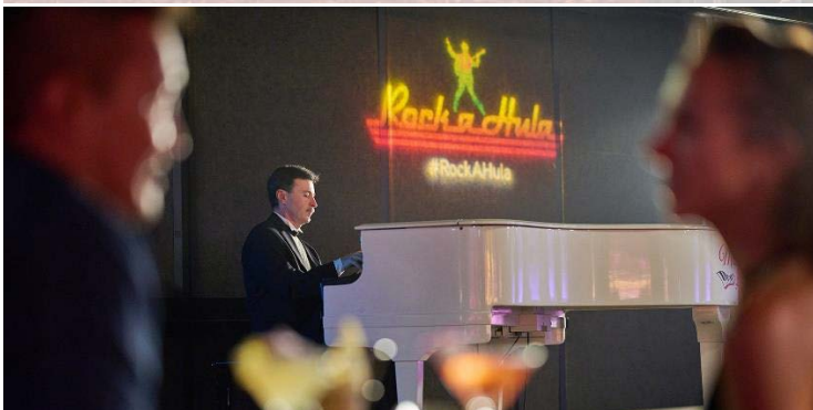
RHE7 Cocktail Music Lounge 2