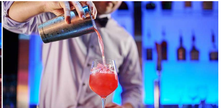
RHE7 Cocktail Music Lounge 6

All images & video are copyrighted; any use must expressly provide photo credit to Rock-A-Hula®.