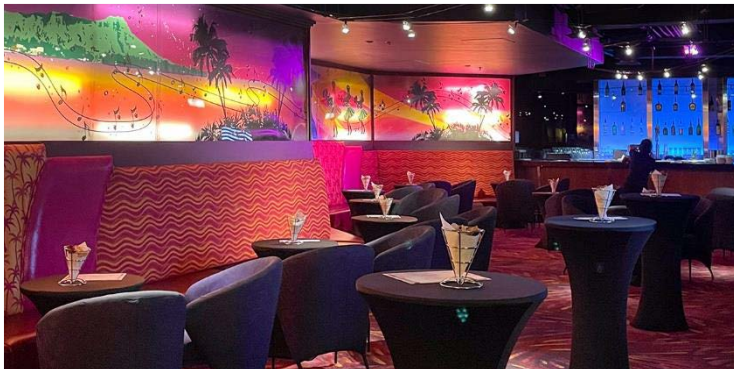
RHE7 Cocktail Music Lounge 5