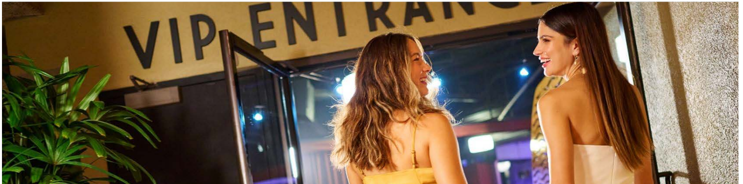
RHE7 Cocktail Music Lounge 4