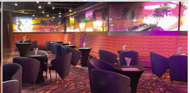
RHE7 Cocktail Music Lounge 3