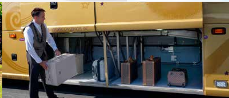
Big Baggage Bay