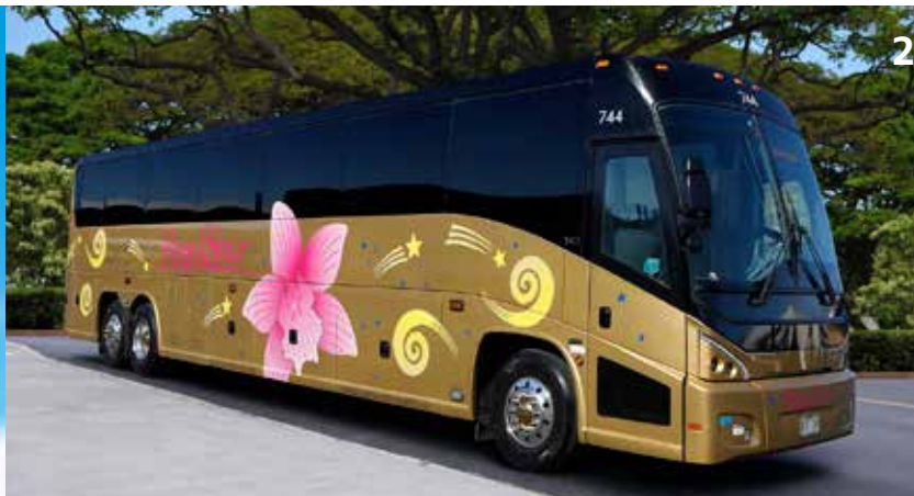
Deluxe Gold Motorcoach Fleet – Operating the Largest, Newest and Cleanest Vehicles in Hawaii