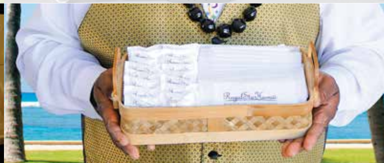
Mint and Towelette Service