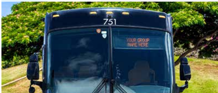
Group Name Digital Signage