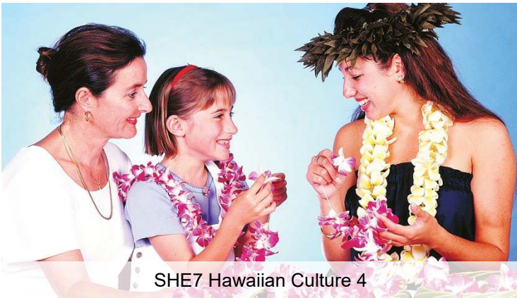
SHE7 Hawaiian Culture 4