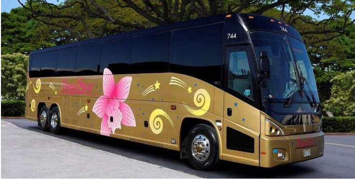
SHE7 Hawaiian Culture 1

Preview our library and download full-size, high-resolution images at StarofHonolulu.com/Travel-Partners-Images .