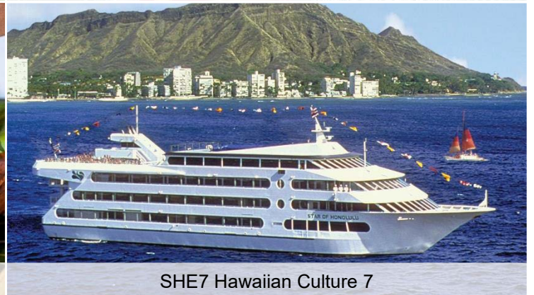
SHE7 Hawaiian Culture 7

All images & video are copyrighted; any use must expressly provide photo credit to Star of Honolulu Cruises & Events®.