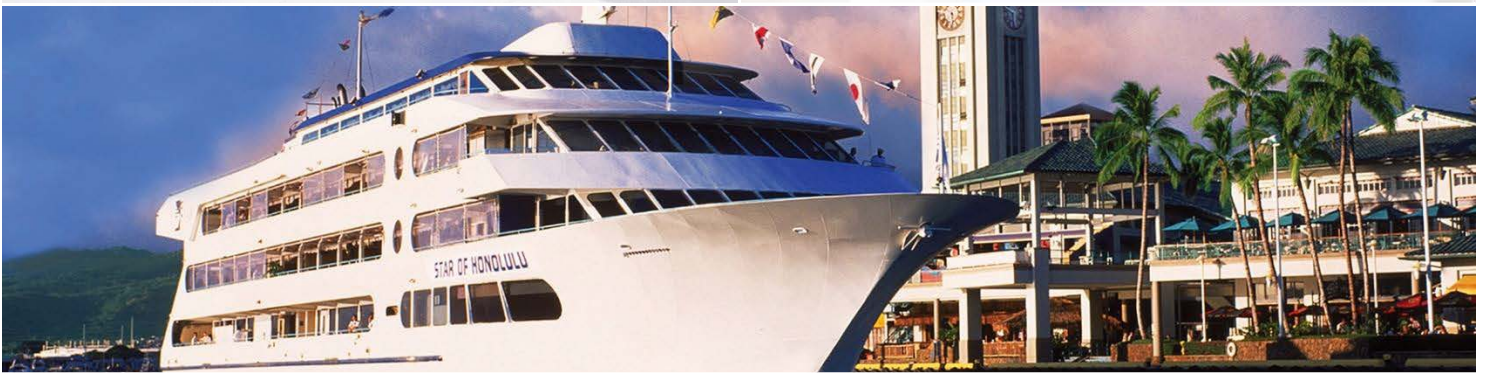
SHE7 Hawaiian Culture 3