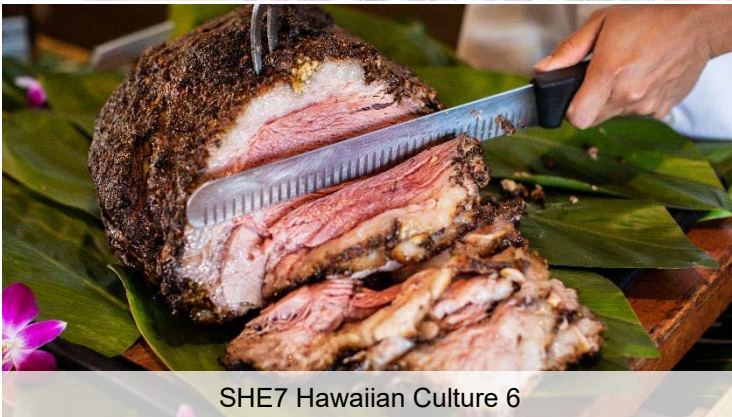
SHE7 Hawaiian Culture 6