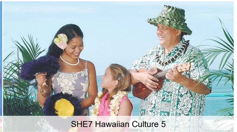
SHE7 Hawaiian Culture 5