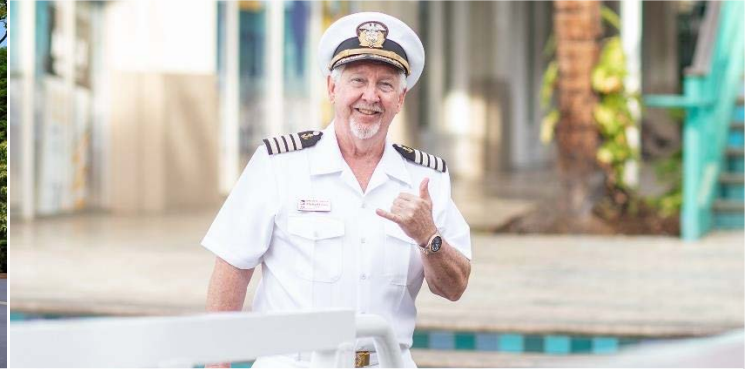
SHE7 Hawaiian Culture 2