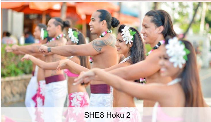
SHE8 Hoku 2