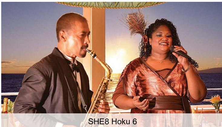
SHE8 Hoku 6