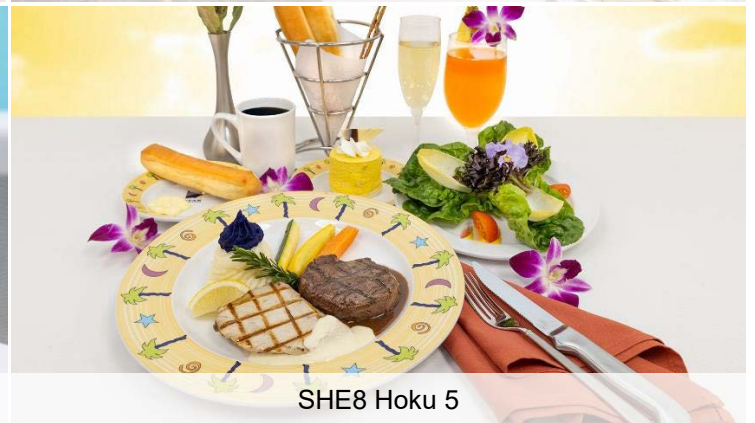
SHE8 Hoku 5