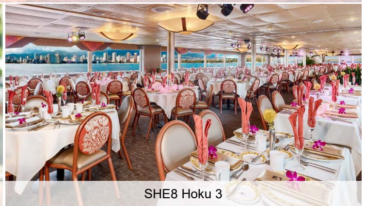
SHE8 Hoku 3