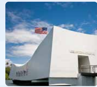
Arizona Memorial Be onboard with Guaranteed Admission (75 minutes)