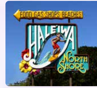
Haleiwa Town Time to have lunch on your own (90 minutes)