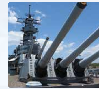
USS Missouri On Ford Island (1½ hours)