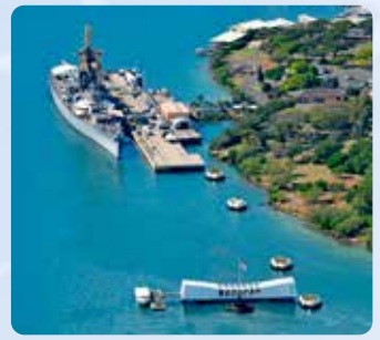
Deluxe Pearl Harbor Be where World War II began and ended

USS Missouri, Arizona Memorial & City 8 Hours 8AM – 4PM with Guaranteed Admission for Arizona Memorial & USS Missouri