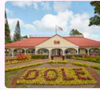
Dole Pineapple Plantation Try delicious Dole Whip (30 minutes)