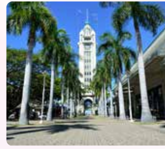
Aloha Tower Landmark and historical downtown (window view)