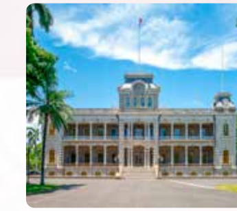
Historical Downtown Iolani Palace, Kawaiahao Church and more (window view)