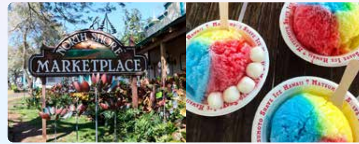
Surfing Town of Haleiwa For your Haleiwa experience, our driver guides will share their local insights and knowledge (120 minutes)