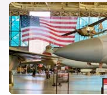
Be on the Actual Site of WWII Historic hangars at the Pearl Harbor Aviation Museum