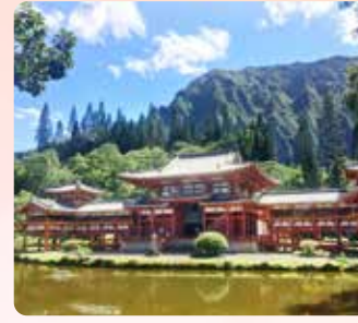
Byodo-In Temple Lush and serene Japanese temple and garden (20 minutes)