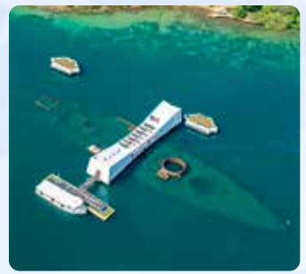
Ultimate Pearl Harbor Complete World War II Experience

Pearl Harbor Aviation Museum, USS Missouri, Arizona Memorial & City 9 Hours 8AM – 5PM with Guaranteed Admission for Arizona Memorial, USS Missouri & Pearl Harbor Aviation Museum