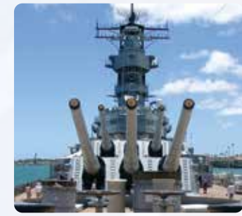
USS Missouri Historic battleship where World War II ended (1½ hours)