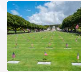
National Memorial Cemetery of the Pacific where the brave are laid to rest (window view)