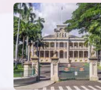
Iolani Palace Only Royal Palace in the United States (window view)