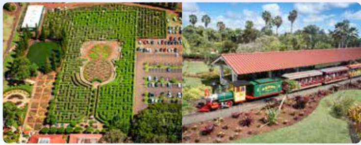
Full Experience at Dole Pineapple Plantation Our driver will help you secure your tickets for the Garden Maze and Express Train Tour (90 minutes)