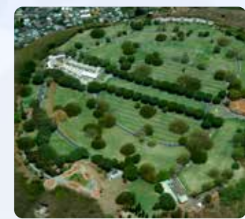
Punchbowl Crater With a panoramic view of Honolulu (window view)