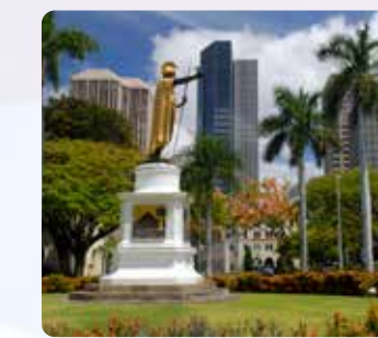
Historical Downtown King Kamehameha Statue and more (window view)