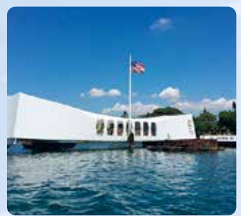
Pearl Harbor Experience Be where World War II began

Arizona Memorial & City 5 Hours 8AM – 1PM with Guaranteed Admission for Arizona Memorial