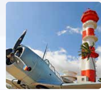
Pearl Harbor Aviation Museum On Ford Island (1½ hrs)