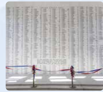
Arizona Memorial Be onboard with Guaranteed Admission (75 minutes)