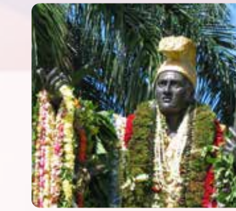
King Kamehameha Statue Historic Landmark (window view)