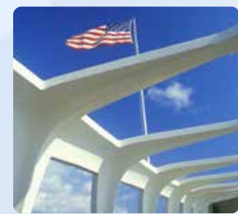
Arizona Memorial Be onboard with Guaranteed Admission (75 minutes)