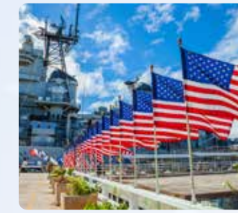
USS Missouri On Ford Island (1½ hours)