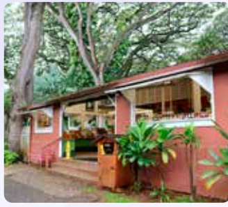
Tropical Farms Sampling of Hawaiian coffee and nuts (20 minutes)