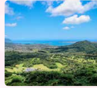
Nu'uuanu Pali Lookout Scenic view and historic battle site (10 minutes)