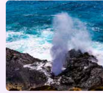
Halona Blowhole Nature's wonder (5 minutes)