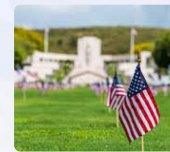
National Memorial Cemetery of the Pacific where the brave are laid to rest (window view)