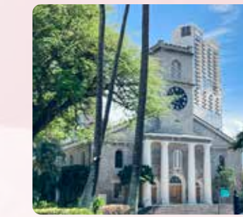
Historical Downtown Kawaiahao Church, Iolani Palace and more (window view)