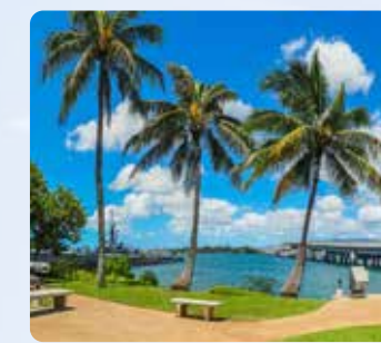
Pearl Harbor Visitor Center and more